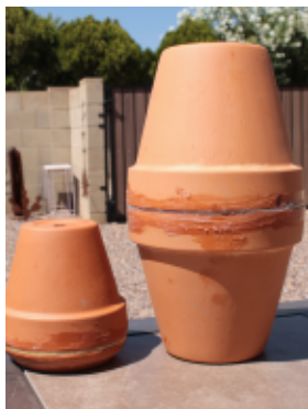
Finished ollas made from a 6" diameter pot (left) and saucer and two 8" pots (right).

Bury your olla with at least 1-2" remaining above the surface. Fill with water. Top off with water again after about 30 minutes and the water has percolated into the soil and clay pores. Place a saucer, mason jar lid, or a flat stone over the hole. Periodically top off the water level of the olla.