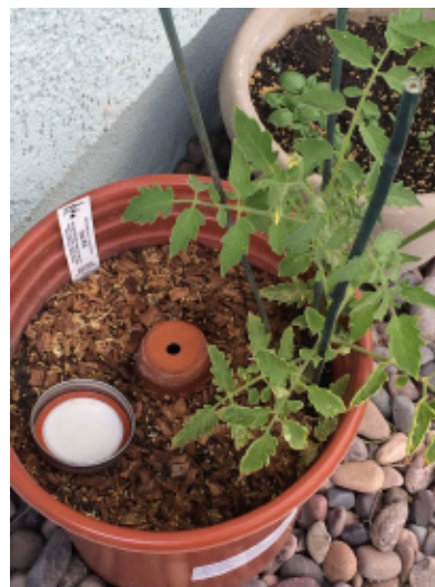
A terracotta pot olla made from 2 6" pots installed in an 18" container planted with a tomato. It is capped with a mason jar lid.